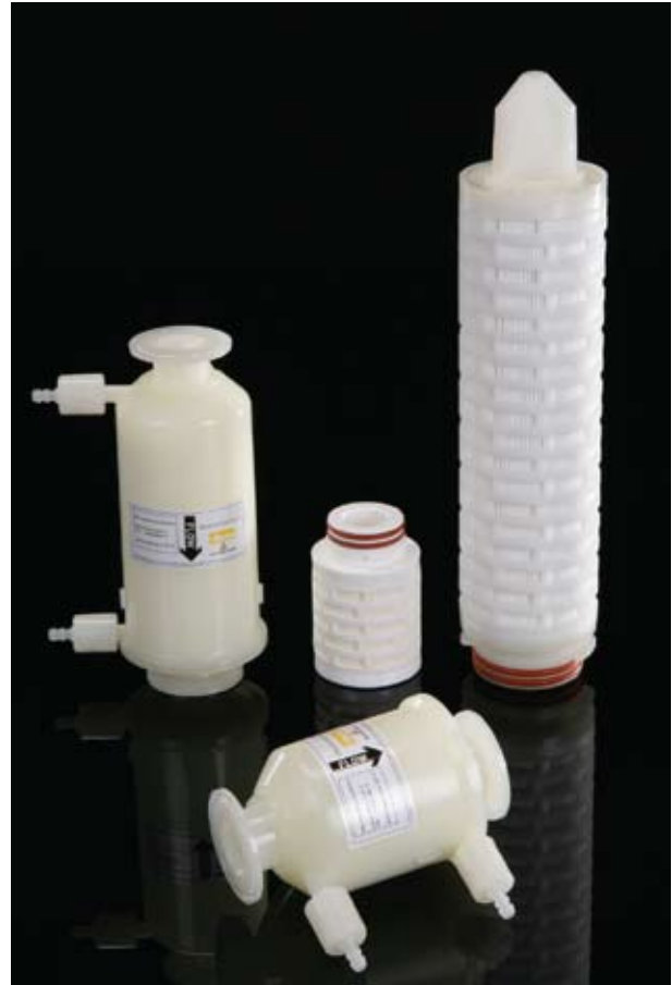
Note: PEPLYN is a registered trademark of Parker domnick hunter